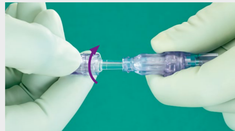
Turn the collar counter-clockwise to disconnect. The hexagonal design of the stop helps to make the disconnection easier.