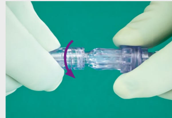
Move collar forward and screw it clockwise onto the counterpart.