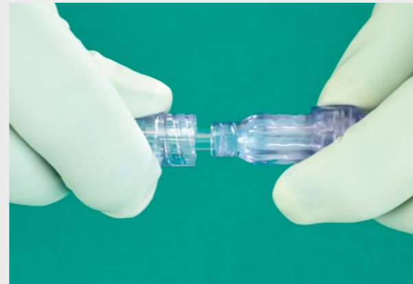
Connect Spin-Lock® connector to counterpart, such as Caresite® extension line.