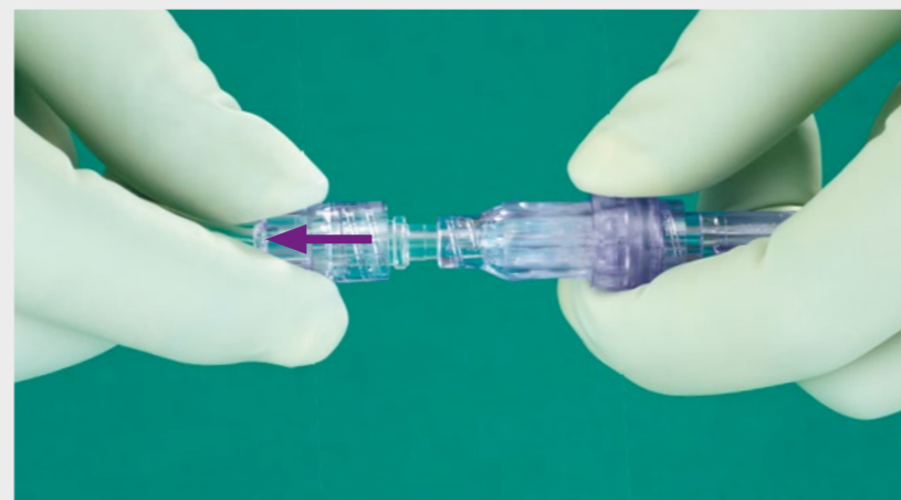
Move collar backwards up to the stop position.