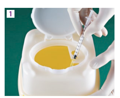
Disconnect luer and luer lock connections between syringe and cannula.