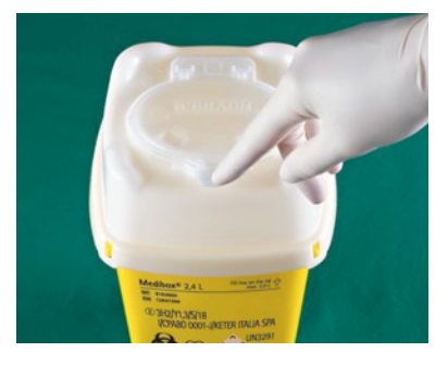
Open the lid by applying slight pressure on the tab – the lid flap jumps up slightly.