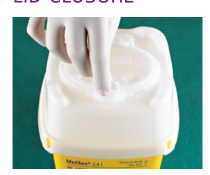
TEMPORARY CLOSURE: Release the lid flap from the standing position and press it lightly onto the housing.