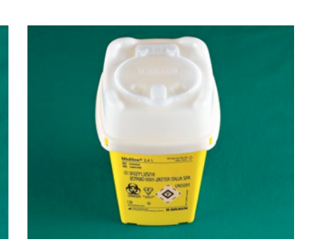
Dispose the permanently closed Medibox® in accordance with your local regulations.

In order to view the Medibox® handling video directly on your mobile phone and to obtain product information, simply scan the QR code with the camera of your smartphone and a suitable reader application and get to the website.