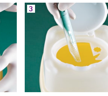
Dispose large medical sharps.