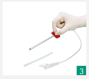
Remove the protection tube to begin the puncture.