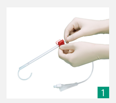
The catheter is already in the cannula. Keep the protection tube on the cannula