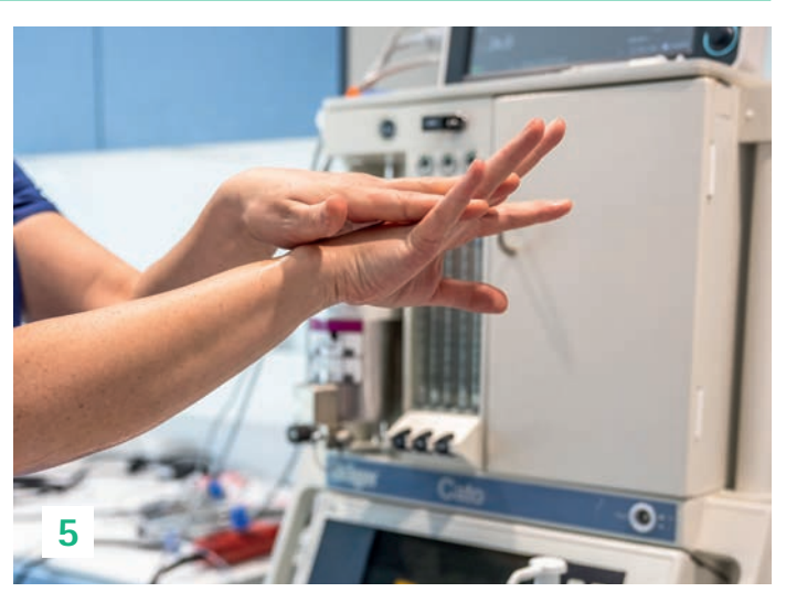
Right palm over the back of left hand and left palm over the back of right hand.