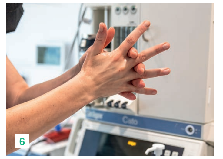
Palm to palm with fingers spread apart.