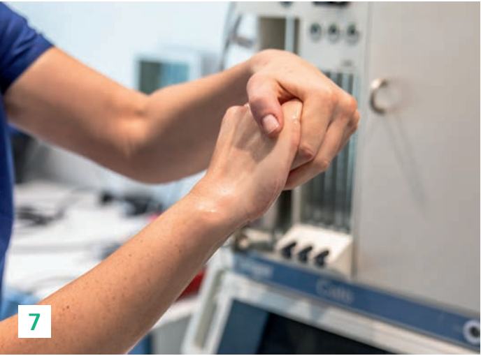
Outside of fingers on opposite palms with crossed fingers.