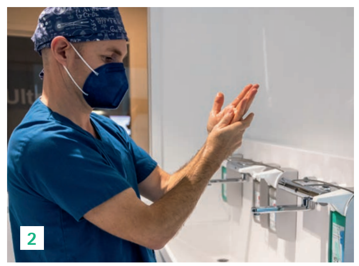
Spread the disinfectant on the right forearm all the way to the elbow. Use circular movements around the forearm to ensure that all areas of the skin are grasped and continue to rub until the disinfectant has evaporated completely (10 – 15 seconds). Repeat the procedure for the other side.

Approx. add 5 ml (3 strokes) of alcohol-based hand disinfectant to the palm of the left hand (press the lever of the dispenser with the elbow of the other arm). Dip fingertips of right hand into hand sanitizer to decontaminate under the nails (5 seconds).