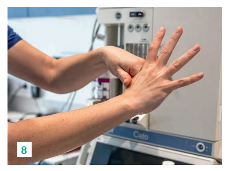
Rub the left thumb in a circular motion in the closed right palm and vice versa.