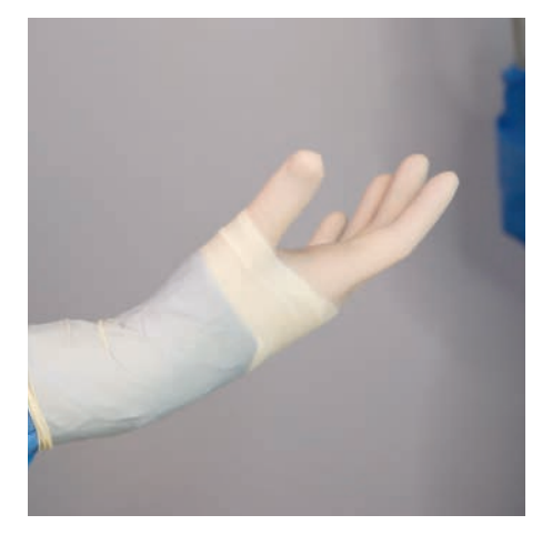
The assistant then releases the glove.