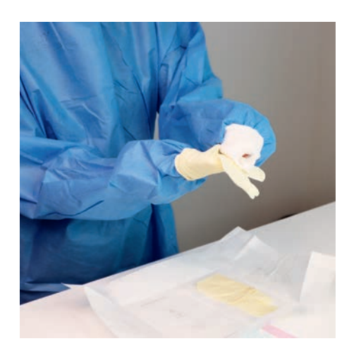
So that it slowly slips into the glove.