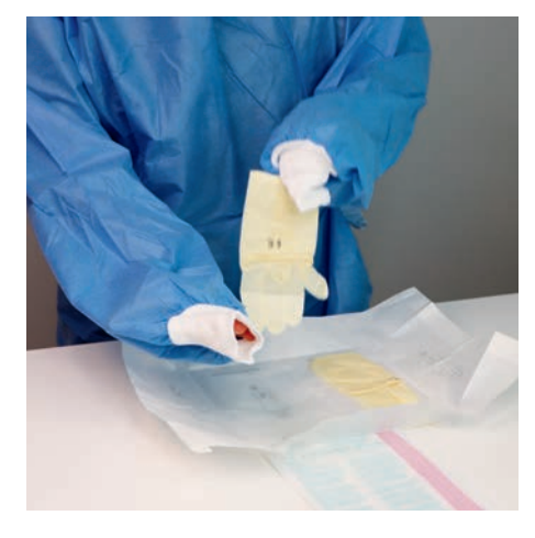
Use the left hand to grasp the right glove, lift it, and place it upside down on the palm (fingers pointing toward the elbow).