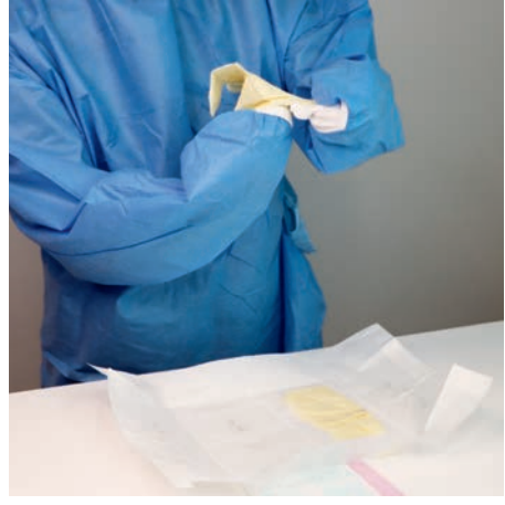
Pull the cuff over the hand.