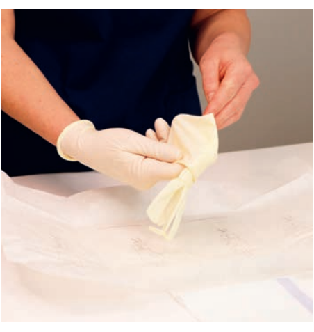
Slide the left hand into the glove.