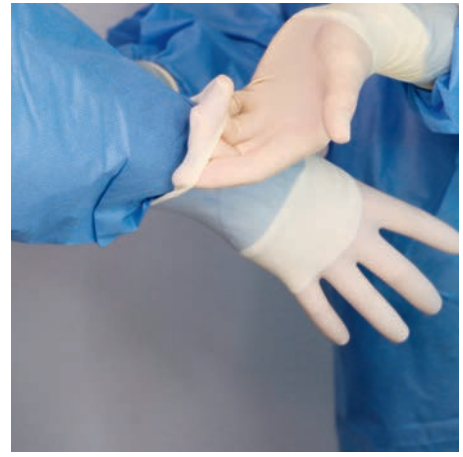
The assistant pulls the cuff of the glove over the cuff of the gown.