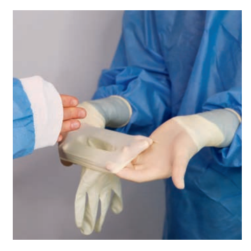
The sterile assistant grasps the glove at the folding point and holds it open. The hand slides into the glove.