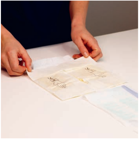
After performing surgical hand disinfection, open the primary packaging.