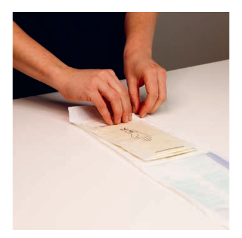
Make sure the work surface has been disinfected and the gloves are at the ready (secondary packaging opened).