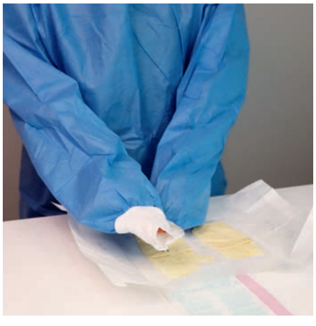
Position right hand with palm facing up and thumb facing out.