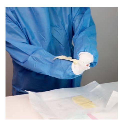
Secure the glove cuff with the index and/ or middle finger and the thumb. Grasp the glove cuff with the index finger and thumb of the left hand (which are covered by the sleeve).