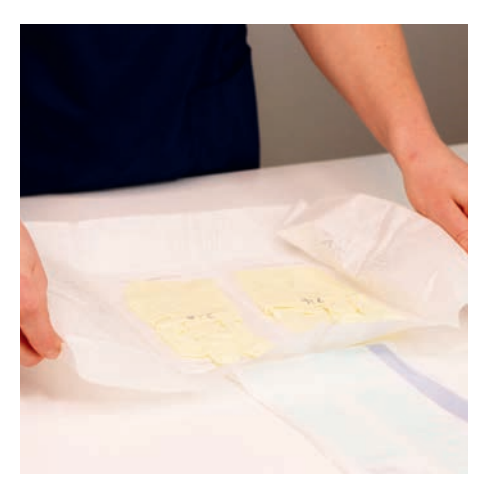
Avoid contamination of the gloves at all costs