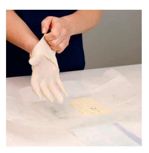
Release the glove cuff at wrist level.