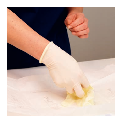
Slide the fingers of gloved hand between the glove and the cuff and lift the glove.