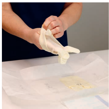
Slide the right hand into the glove.