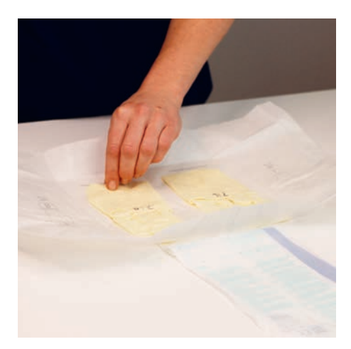
Grasp the folding point of the right glove cuff with the index finger and thumb of the left hand.