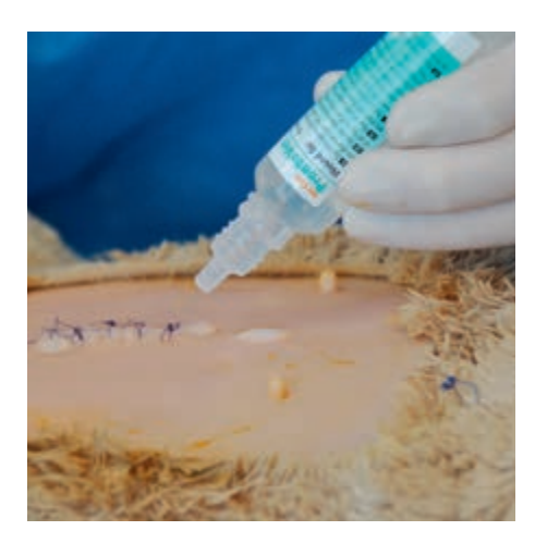
The wound will remain permeable to bacteria for 24 hours. As such, it is advisable to apply ProntoVet® wound gel to the wound.