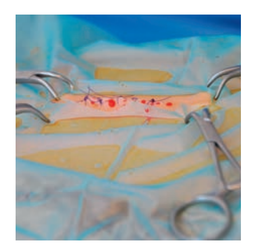
After wound closure, remove the dressing.