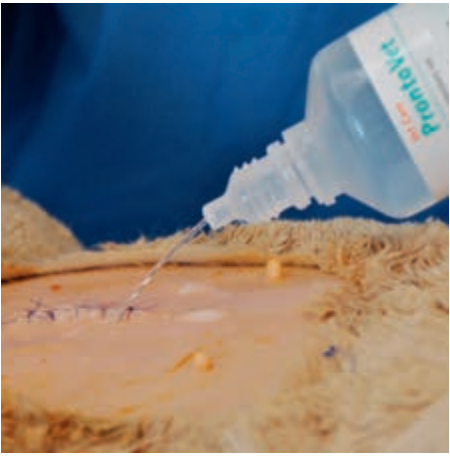
Clean the wound with ProntoVet® wound irrigation solution.