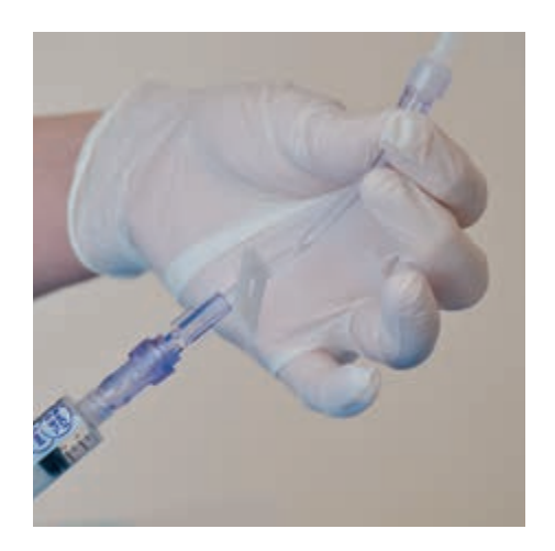
Flush extension with needle-free valve (CareSite®).