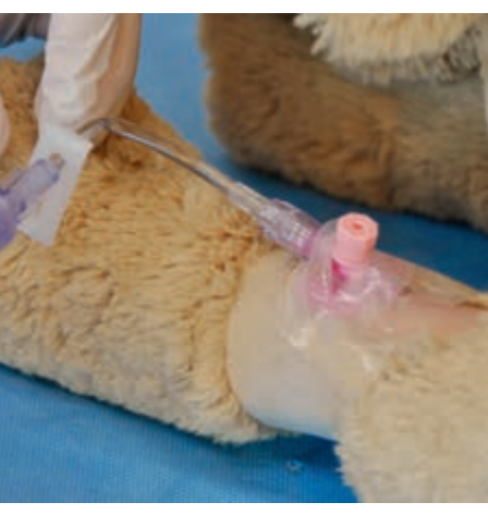
After that, connect it to the catheter and flush it.