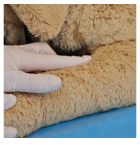
Apply tourniquet and palpate vessel.