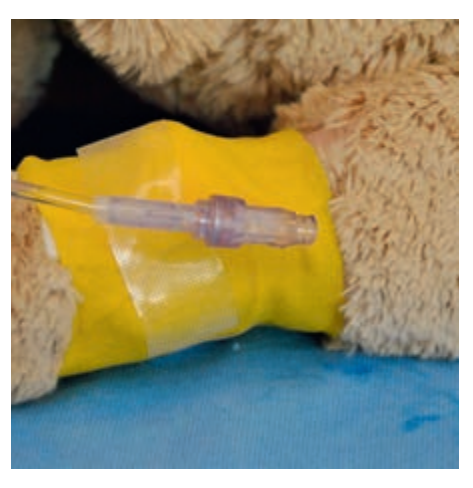
Apply a protective dressing (Askina® Color) and secure the extension with a sterile bandage (Askina® Fix).