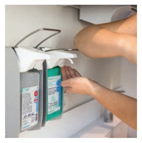
Perform hygienic hand disinfection (e.g., Softa-Man® pure).