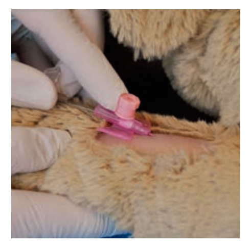
Advance the catheter into the vessel along the cannula. The second flash back will become visible to indicate that the catheter is in the vessel.