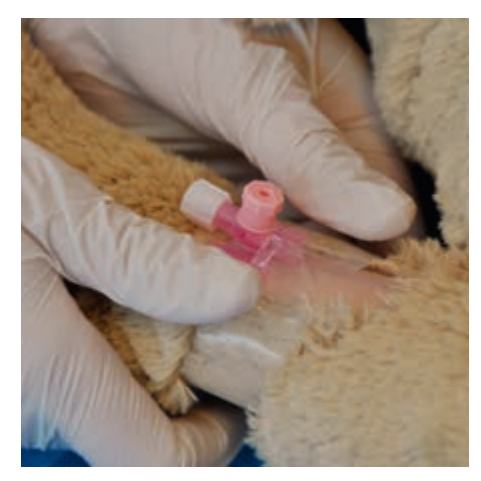
Secure the catheter with a sterile/low-germ bandage (e.g. Askina® Silk).