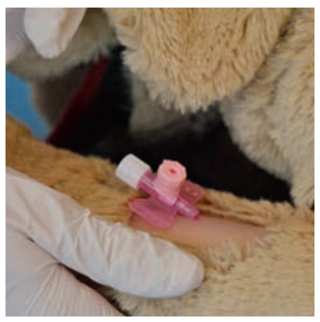
Remove the cannula from the catheter and close the catheter.