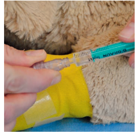
Medication administration and rinsing with sterile 0.9% NaCl solution.