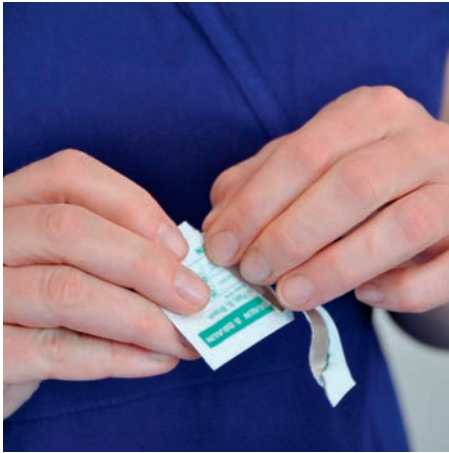
Wipe- or spray-disinfect the CareSite® valve before administering medication.