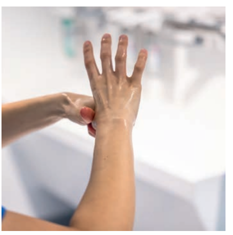
Before applying the antiseptic, disinfect hands and put on sterile surgical gloves.