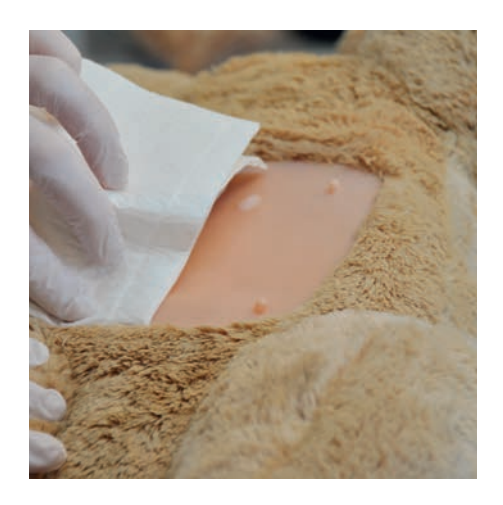
After one minute, any foam residue can be removed with a clean cloth. Bring the patient into the OR. Position the patient safely for the procedure.