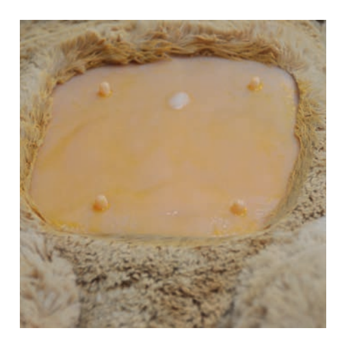
Leave the product on for the specified exposure time.