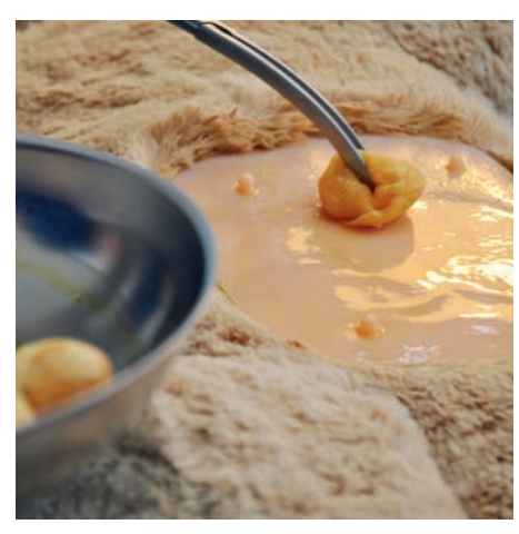
Aseptic: Goal 1) rapid, significant reduction of resident skin flora; 2) long-lasting (remanent) aseptic effect. Moving from the center to the periphery, rub the skin for 30 seconds with sterile swabs dipped in Braunoderm® and sterile dressing forceps.