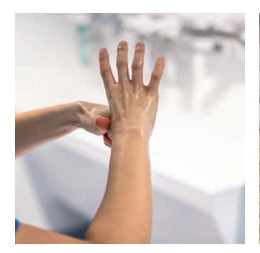
Perform hygienic hand disinfection and put on low-germ examination gloves.