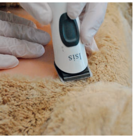
Immediately before operating, trim the hair using clean, sharp clippers. Avoid wet shaving to prevent skin injuries. Use a paper towel or a (contactless) vacuum to remove the trimmed hair.